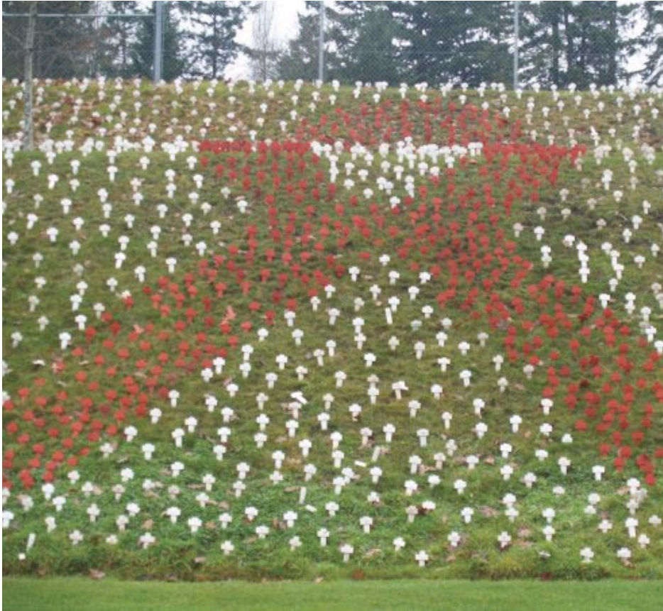
Students of the Global Youth at GISS installed the public art display of 'A Day of AIDS' for World AIDS Day on December 1, 2008