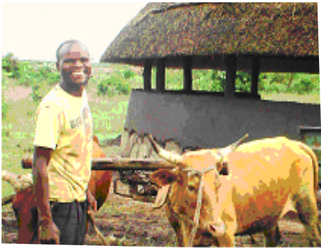
The Community Center at Masango, Zimbabwe

In the dry grasslands of Zimbabwe, just 25 kilometres from the capital of Harare, Masango Cultural Center is growing hope in this time of struggle. In Seke, locals are gathering to discuss self-reliance, renew their connection to traditional practices, and implement community projects.